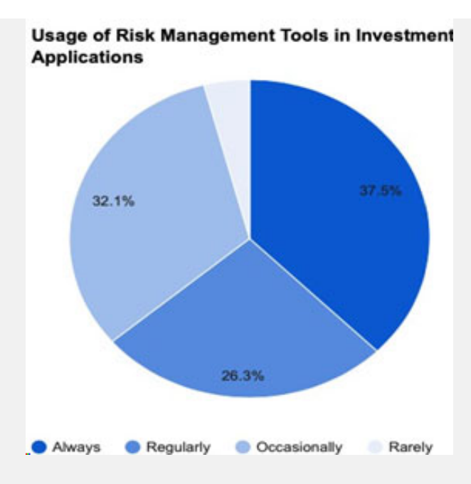
Figure 2 – Pie chart of Risk Management tool Usage

The pie chart visually represents the frequency with which individuals utilize risk management tools within investment applications across various time periods. The data is segmented into four categories, revealing that 37.5% of respondents always use such tools, 26.3% use them regularly, 32.1% use them occasionally, and only 4.1% use them rarely. Overall, a significant majority of individuals (63.8%) demonstrate a proactive approach to risk management by utilizing these tools at least occasionally. This pattern suggests a growing awareness among individuals about the significance of managing risk when engaging in investment activities.